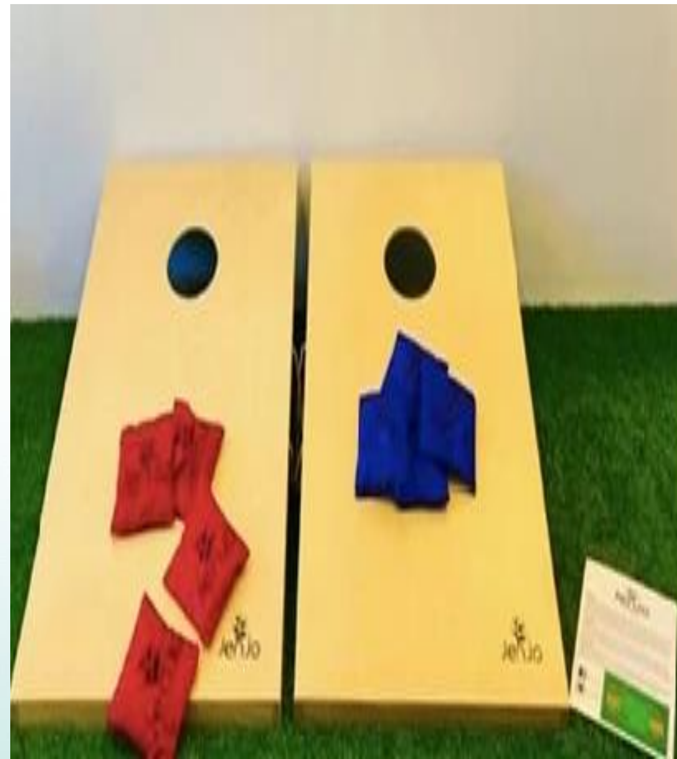
Giant Sack Toss