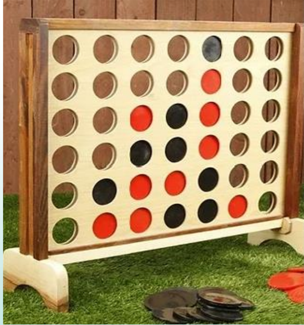
Giant Connect 4