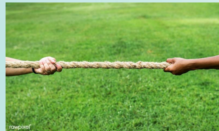
Tug a War