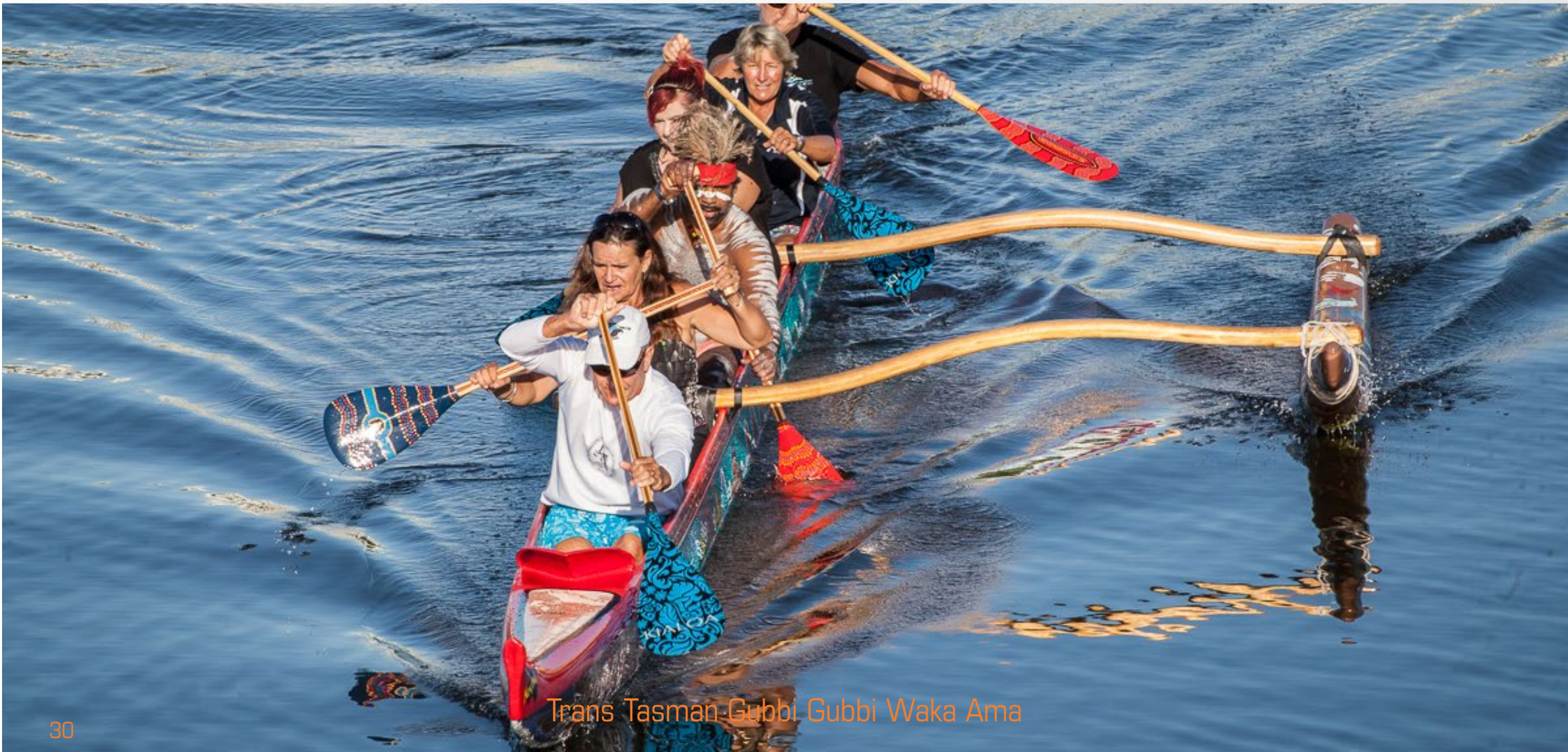
Trans Tasman Gubbi Gubbi Waka Ama