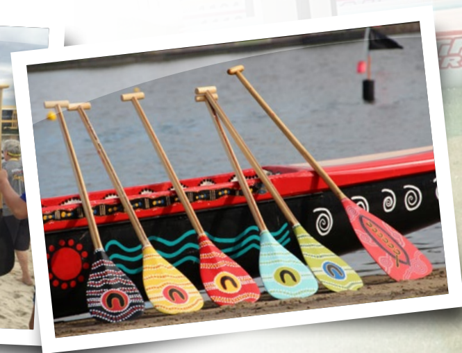
Trans Tasman Gubbi Gubbi Waka Ama