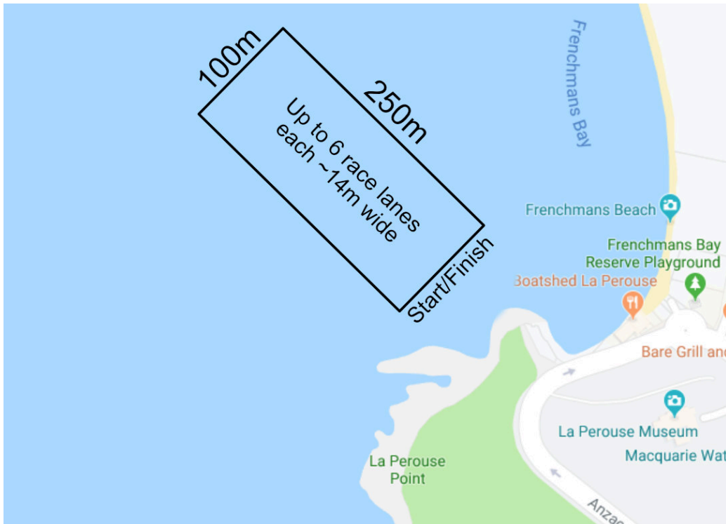
Overall Sprints Course Layout

There will be a series of heats and a final for each division using the Tail Race and Repechage system, which is based on the number of crews entered for each division. Crews will race in a minimum of 2 races per distance in each division.